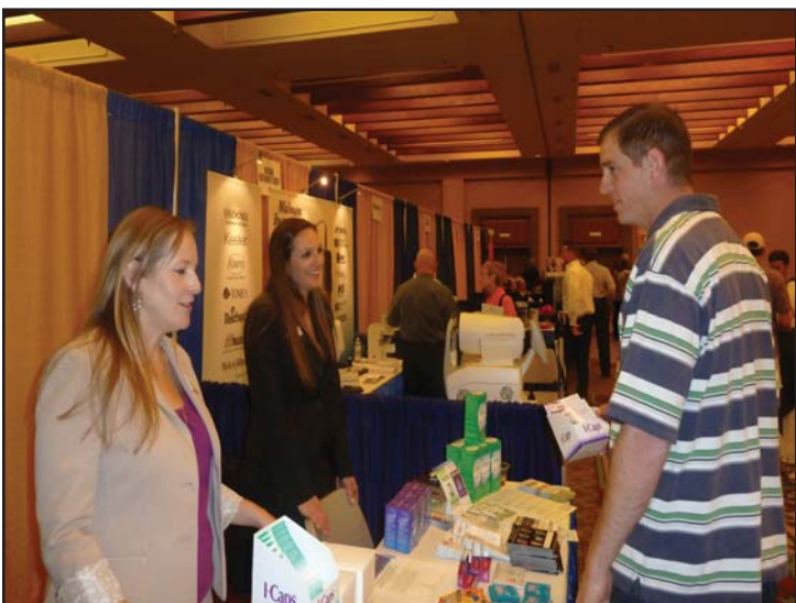
Above: Alcon Laboratories displaying their materials in the exhibit hall