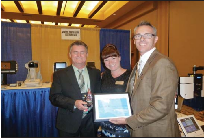
Above: Veatch Ophthalmic Instruments receiving the 2013 AZOA Sponsorship Award in the exhibit hall